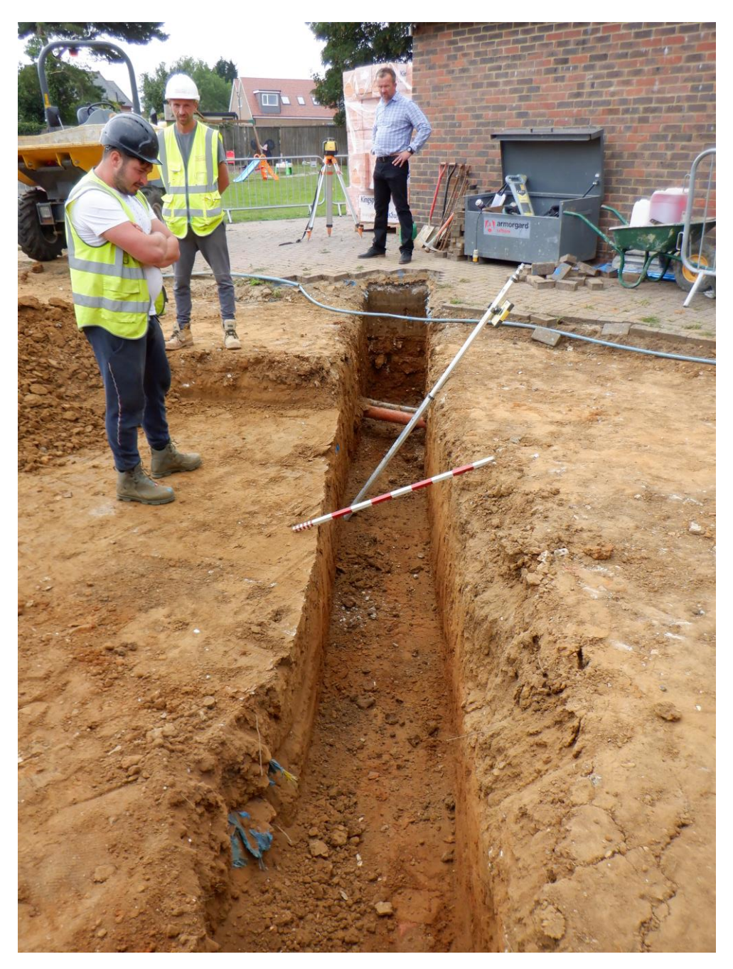
Plate 6. View of trenching in progress