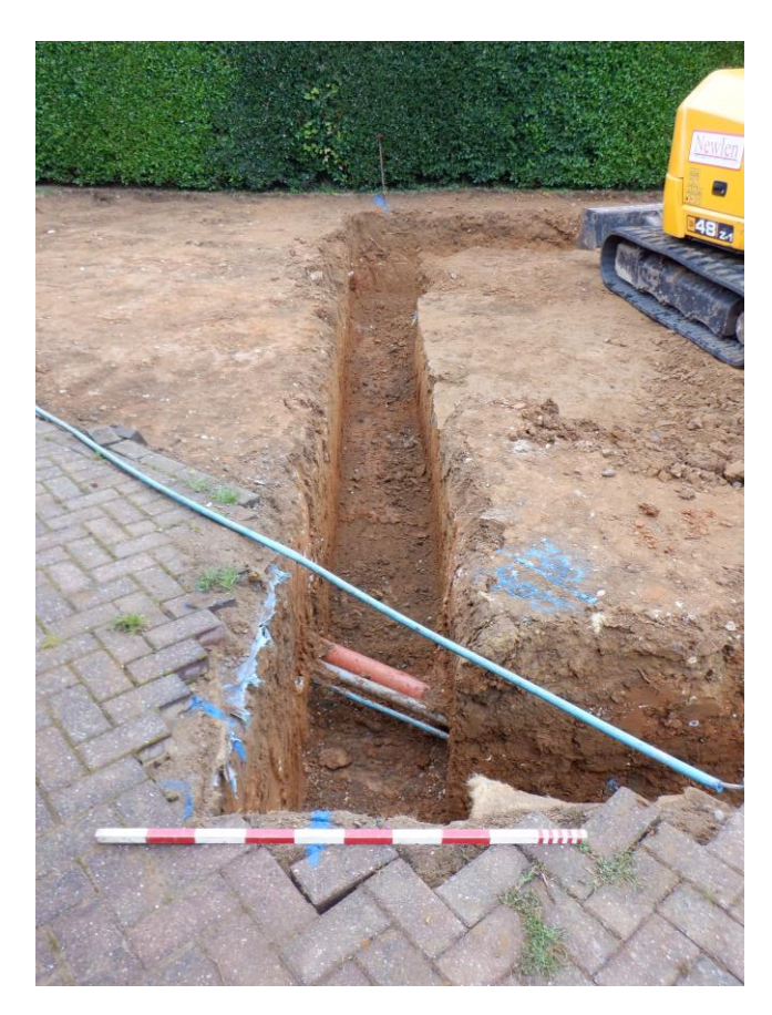
Plate 4. Foundation trenches (looking E)