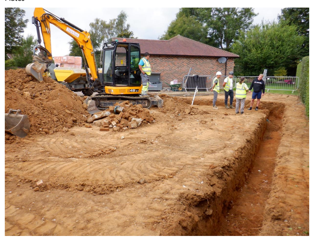
Plate 1. View of trenching in progress (looking N)