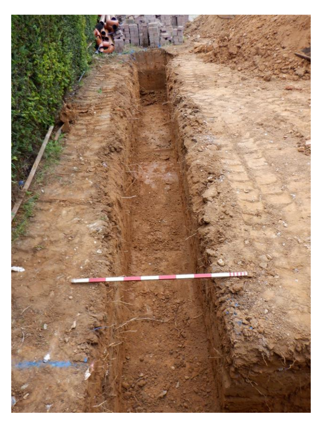
Plate \ 2. \ View \ of foundation \ trenching \ (looking \ NNW)