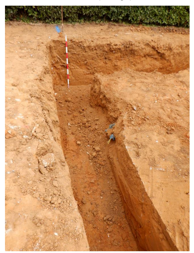
Plate 5. View of section (looking E)